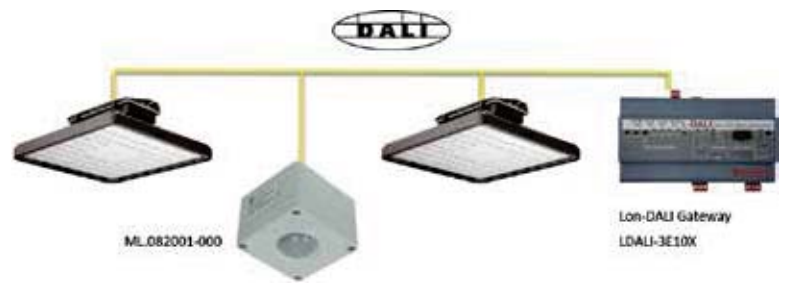
DALI communication solution